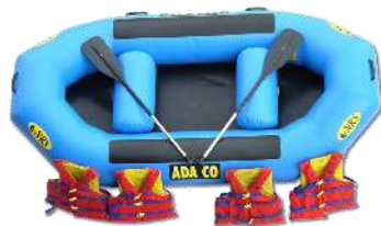
4 Person Raft

Raft + 2 paddles + 4 vests $55.00 + sales tax