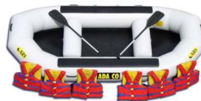
6 Person Raft

Raft + 2 paddles + 6 vests $65.00 + sales tax