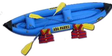
2 Person Inflatable Kayak

Kayak + 2 paddles + 2 vests $40.00 + sales tax