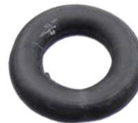
Tubes for Sale

Kayak + 2 paddles + 2 vests $40.00 + sales tax