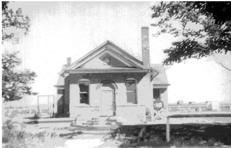
Photo: Original Hillsdale School