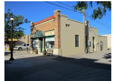
Photos: Mountain States Telegraph Building where the Valley Times newspaper was located.