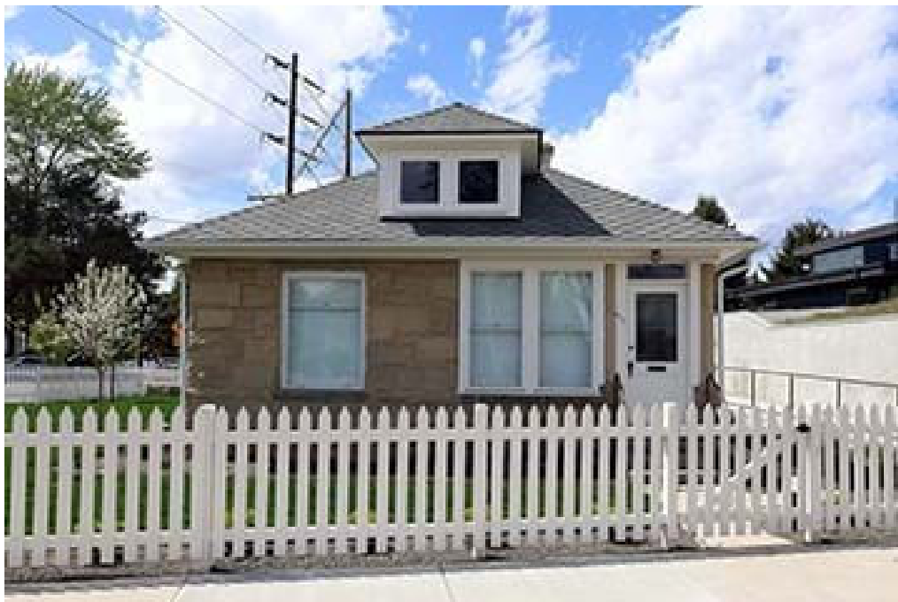
Erma Hayman House