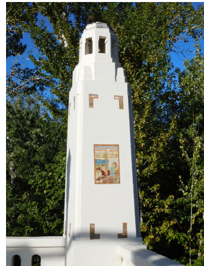
Capitol Boulevard Bridge