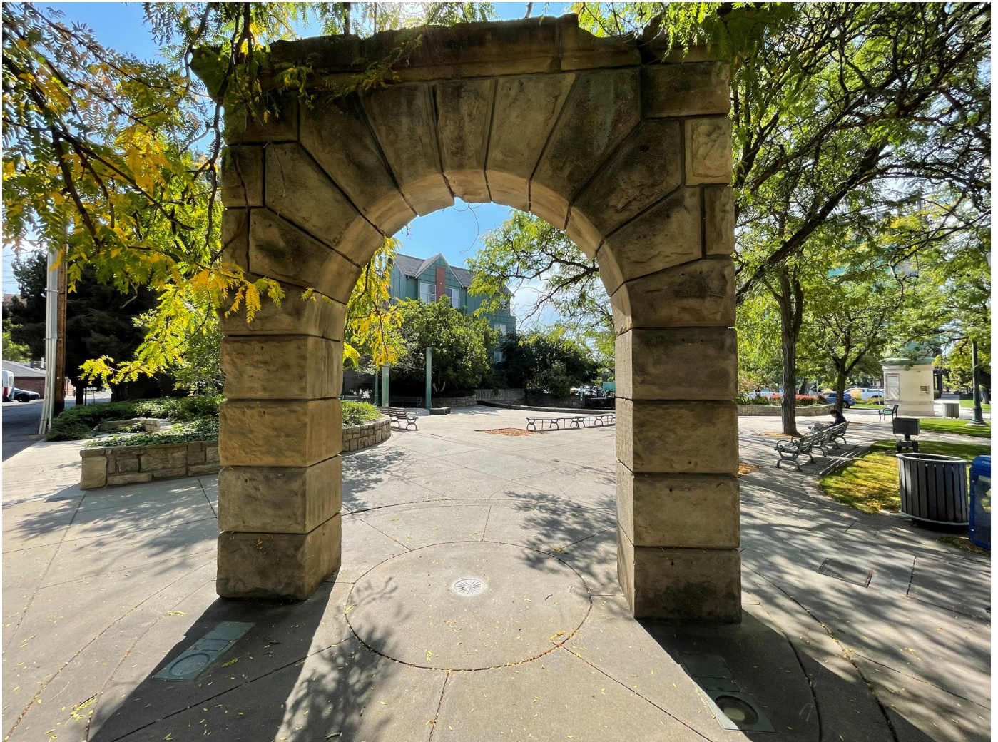
C.W. Moore Park