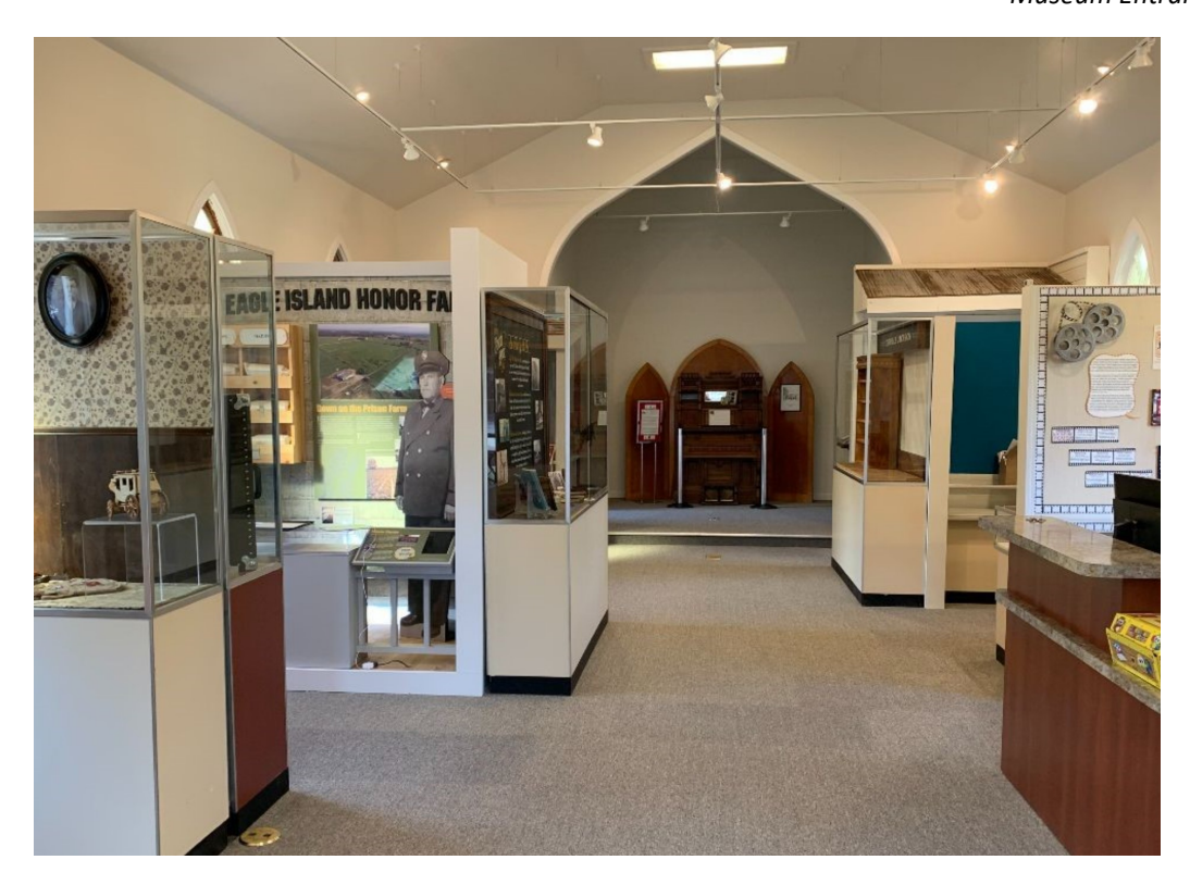
Interior of the Eagle Museum of History and Preservation

The Ada County Historic Preservation Council wishes to acknowledge the efforts of the Eagle Museum of History and Preservation for preserving this Ada County Treasure.