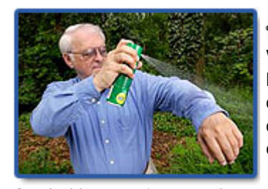
Get double protection: wear long sleeves during peak mosquito biting hours, and spray DEET repellent directly onto your clothes.

(http://www.epa.gov/pesticides/factsheets/alpha_fs.htm) from the EPA.