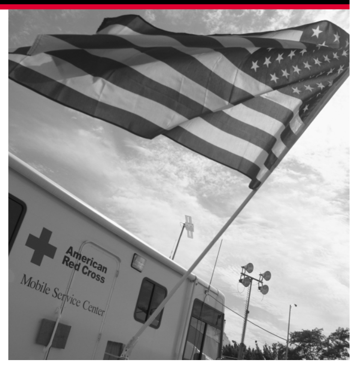
An American Red Cross mobile service center stationed at the Pentagon Sept. 18 shows one small part of the ongoing response you can expect from the Red Cross in the advent of any disaster.

Devastating acts, such as the terrorist attacks on the World Trade Center and the Pentagon, have left many concerned about the possibility of future incidents in the United States and their potential impact. They have raised uncertainty about what might happen next, increasing stress levels. Nevertheless, there are things you can do to prepare for the unexpected and reduce the stress that you may feel now and later should another emergency arise. Taking preparatory action can reassure you and your children that you can exert a measure of control even in the face of such events.