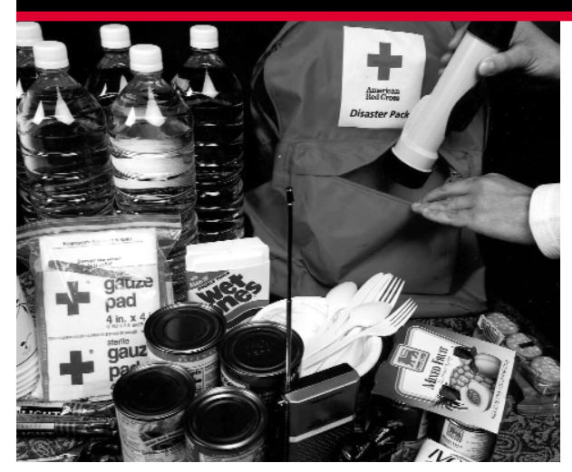
A disaster supply kit, with items like those shown and a radio and extra batteries, is an essential resource in times of emergency.