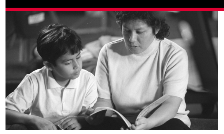
Children need to know their family members' phone numbers and e-mail addresses. The information should be carried with them to school and easy for them to find at home.