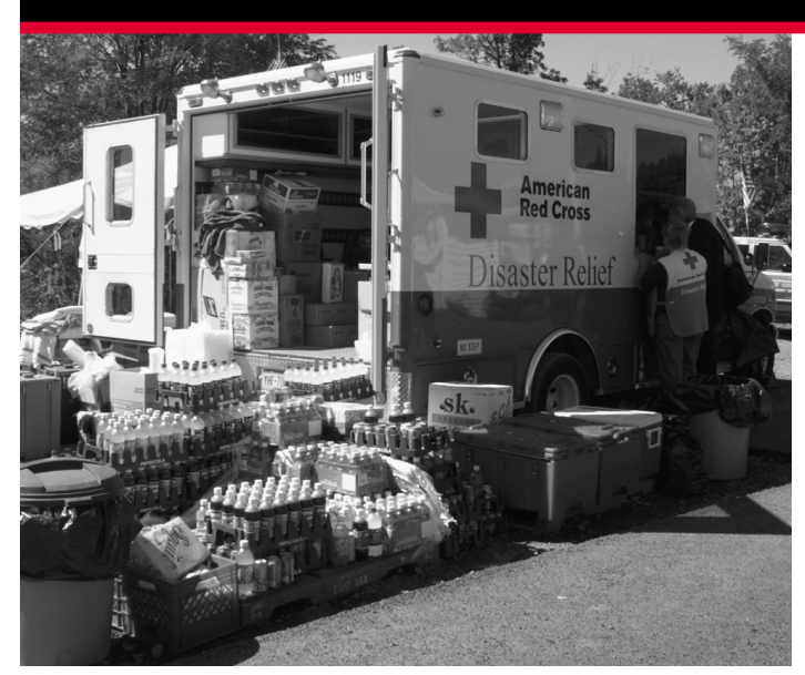
Supplies for rescue workers are unpacked at the Pennsylvania crash site on Sept. 13. The Red Cross can provide necessities very quickly to almost any location for as long as they are needed.