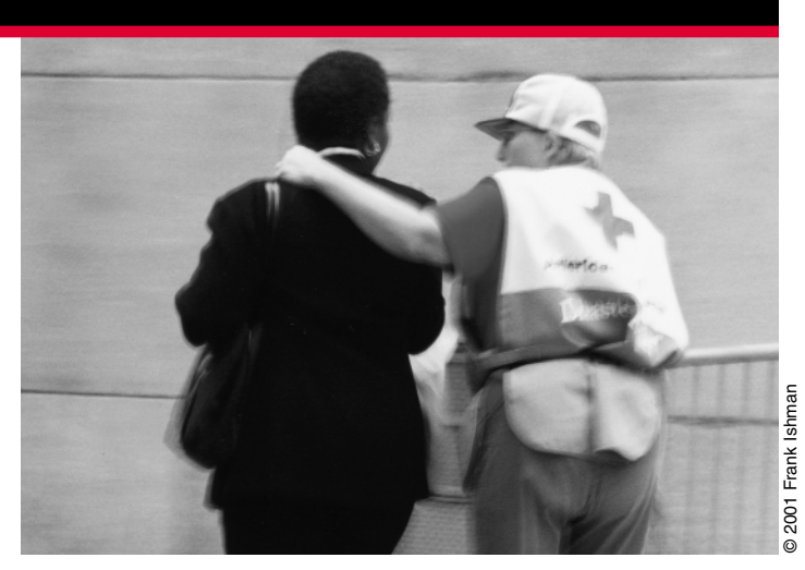
On Sept. 14 in New York City, a Red Cross worker comforts a woman shaken by the World Trade Center attack.

For more information on putting together a disaster plan, request a copy of the brochure titled Your Family Disaster Plan (A4466) from your local American Red Cross chapter. You may also want to request a copy of Before Disaster Strikes... How to Make Sure You're Financially Prepared (A5075) for specific information on what you can do now to protect your assets. These documents are also available at www.redcross.org.