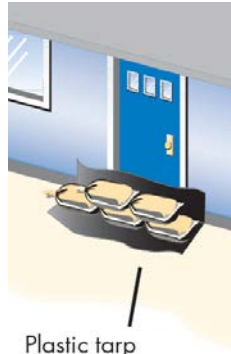
Plastic tarps between structures and sandbags can help keep floodwater from seeping