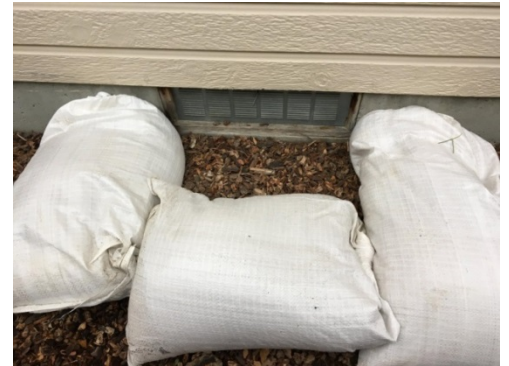
In front of vents or windows near the foundation of buildings (Note: Sealing foundation vents can prohibit air circulation and encourage mold/mildew)

For multiple sandbag layers, use a pyramid placement. Place \frac{1}{2} to \frac{2}{3} filled bags lengthwise and in direction of the flow. Keep unfilled portion under the weight of the sack.