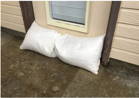
Lining bottom of front, back, side, or garage doors