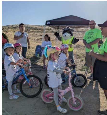
Scrapy cheers on the cyclists