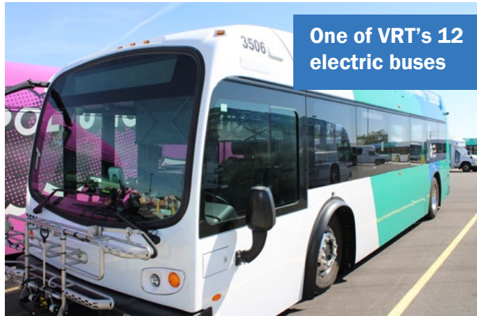
One of VRT's 12 electric buses