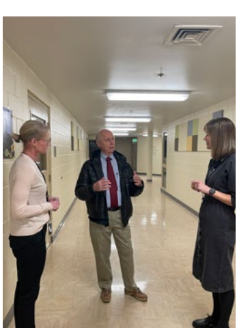
To learn more about the facility and how youth and families are being served visit: