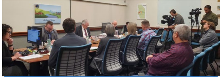
The Ada County Commissioners voted unanimously to not put the issue on the November ballot

READ THE DECISION HERE: https://adacounty.id.gov/blog/news/meridian-library-district-decision/