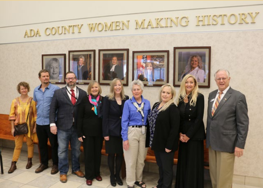
Ada County Board of Commissioners with Ada County Women Making History Honorees